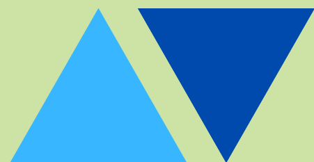
St. George's colours

At the game, fashions are coordinated around these colours from head to toe – from ties to shirts and shorts, to earrings to manicures, so pick a side!